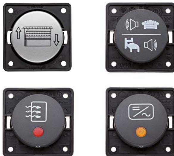
Berker Integro switch printed with special symbols