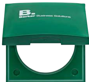
Berker Integro – Design Flow hinged cover, with individual printing