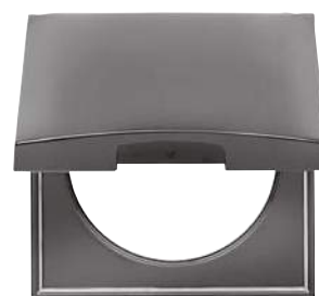
Berker Integro – Design Flow/Pure Hinged cover black chrome, glossy, galvanised