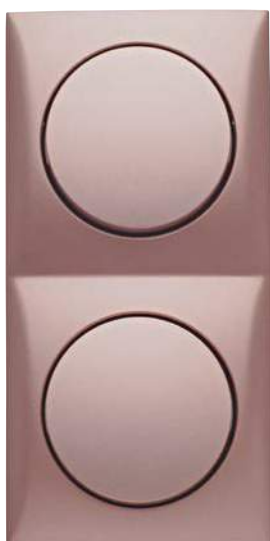
Berker Integro – Design Flow 2-gang switch combination copper, matt, lacquered